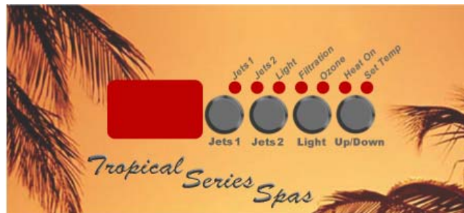
Single Pump TSC-44 Tropical Control System With Air