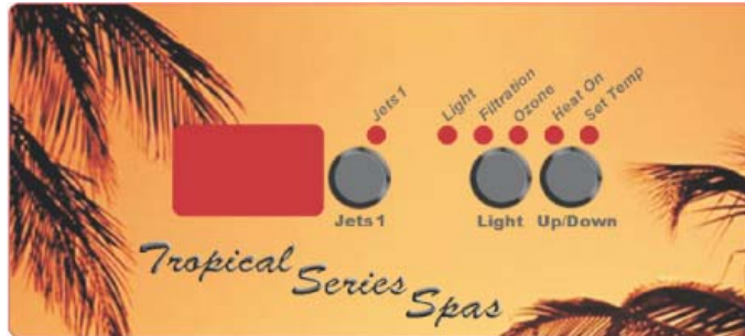
Dual Pump TSC-18 Tropical Control System